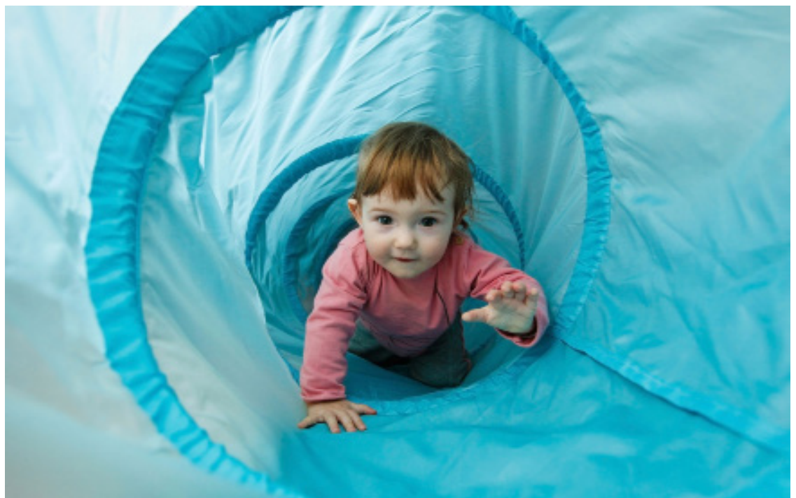
A pleasant environment can make a huge difference to your child's development